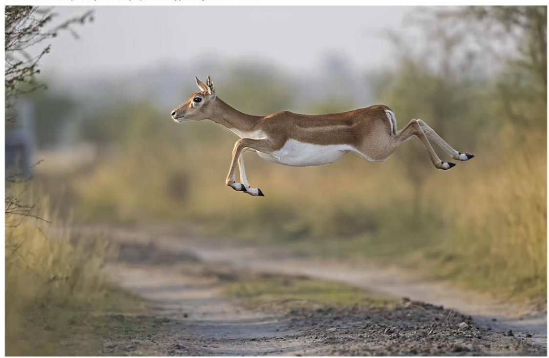
Blackbuck Female (Antilope cervicapra), Taal chappar, Rajasthan...Oct 2016

While the park is best place to shoot harriers like Montagu's Harrier Marsh Harrier & Pallid Harrier, the adjoining area to the park where the cows are grazed (Gowshala) is the most happening area for Eagles, Buzzards and Falcons.